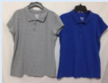
Gray and Royal Blue are not dress code colors